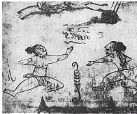
Figure 4 Koguryō tomb mural in Jian City, Northeast China Muyong ch'ong (舞蹈塚, ‘Dancers’ tomb’)

Another often quoted ‘proof’ for the existence of ‘ancient’ taekwondo is a tomb mural from the Koguryō period (37 BCE–668 CE), which depicts two protagonists in fight-like positions (first cited by Yi Sōn-gŭn 1968: 26). The addition was welcomed by taekwondo leaders, who could now claim an even more ancient taekwondo lineage, which is usually generously rounded up to 2000 years, in most popular publications (see for example, Gilles, and Choue 2010: 4). 36 Subsequently, during the early 1970s, the ancient murals were added by the book’s authors (Hwang 1970: 37; Yi Chong-u 1972: 17–23) to the ‘list of proofs’ for taekwondo’s ‘long history.’