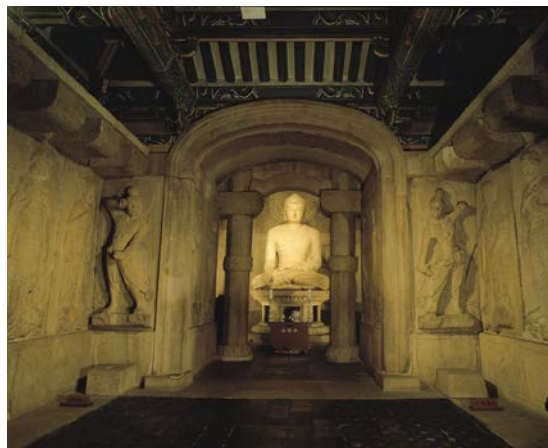
Figure 3 Sökkuram Grotto, near Pulguksa temple The two Kūmgang yōksa statues are located next to the right and left of the arch.